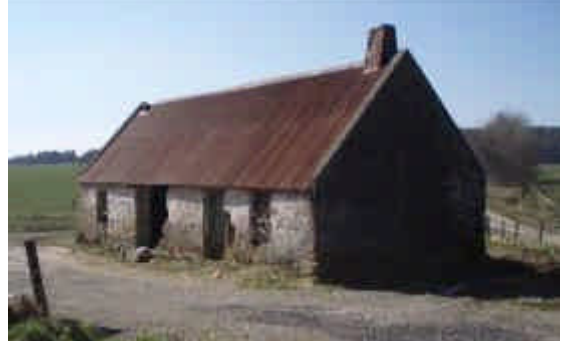
Fig. 2: Pollowick Cottage, as existing

3. The refurbished cottage element of the property would include the aforementioned entrance porch, as well as the kitchen, utility, WC and cloakroom. A corridor would lead into the new extension where ground floor accommodation would include a lounge, dining / family room and one en suite bedroom. The remaining two bedrooms and bathroom would be located on the first floor of the new extension.