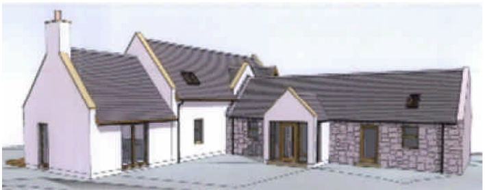
Fig. 3: New extension (left) and refurbished cottage (right)

3. The refurbished cottage element of the property would include the aforementioned entrance porch, as well as the kitchen, utility, WC and cloakroom. A corridor would lead into the new extension where ground floor accommodation would include a lounge, dining / family room and one en suite bedroom. The remaining two bedrooms and bathroom would be located on the first floor of the new extension.